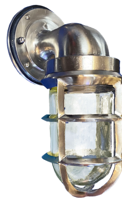
(Satin Nickel, J-Box Adapt)