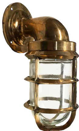
(Standard Finish, Wood Block Mount)