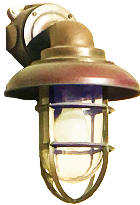
Wood Block Mount