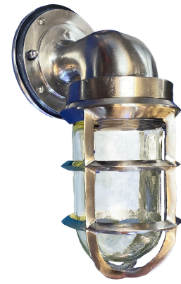
(Satin Nickel, J-Box Adapt)