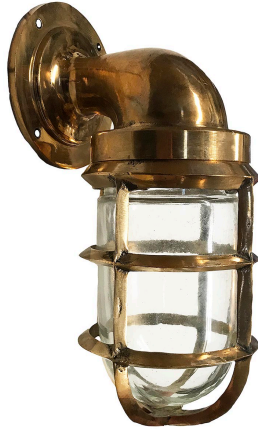
(Standard Finish, Wood Block Mount)